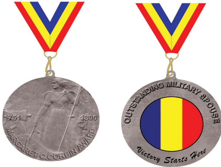
Figure B-1. MCC Award emblem